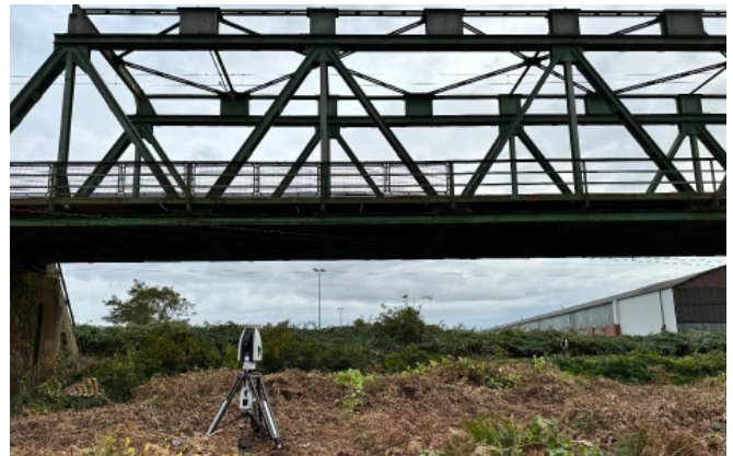
Precision Digitization - Despite challenging conditions, the team successfully digitized the bridge in just three days.