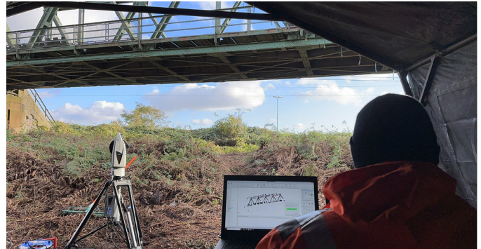
Real-Time Data Display - SpatialAnalyzer software provided real-time feedback, ensuring comprehensive data capture and efficient scanning.

He continued, “We opted for the AS1-XL to scan the joints and connections between the different steel parts — especially from the top side — because it let us go inside the parts with it and capture those hard-to-reach areas.”