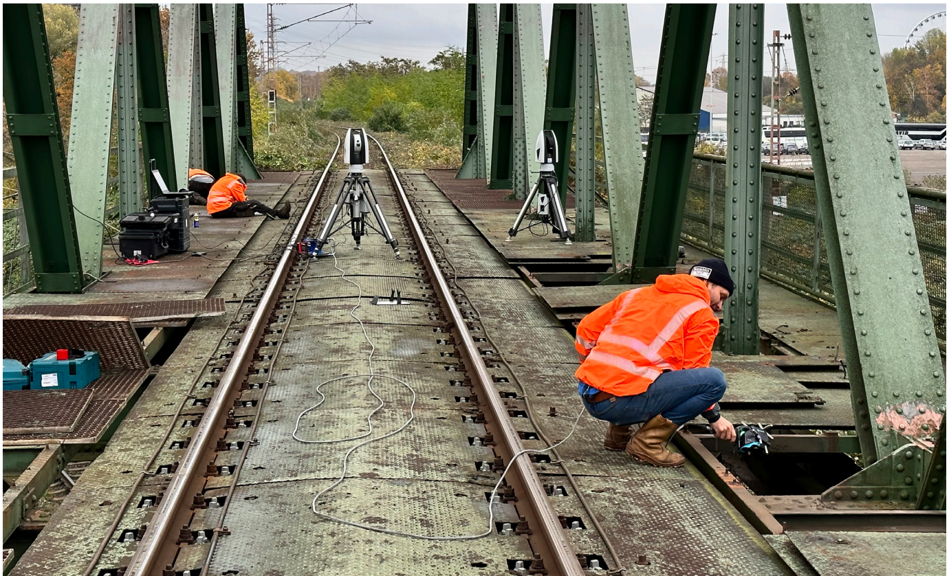
Unified Spatial Metrology Network (USMN) - SpatialAnalyzer's unique USMN feature enabled seamless data integration from multiple scanning locations.

Knowing that accuracy was paramount, the team took precautions to ensure their measurements were correct. "Whenever a train was passing by, we stopped the scan — and after it passed, within SpatialAnalyzer, all we had to do was click a single button, and it would re-measure all visible points. We could see if the train passing influenced our scan data; if it showed it did influence it, we reset things, but if it had no influence, we continued to scan. This enabled us to effectively maintain our scanning accuracy, guaranteeing that the measurements we were gathering were as accurate as possible," he said.