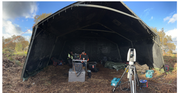
The metrology team needed a durable tent to protect themselves and their equipment from inclement weather during their time on site.

“ The only way to get new drawings of the bridge is to scan it in with the highest accuracy possible”