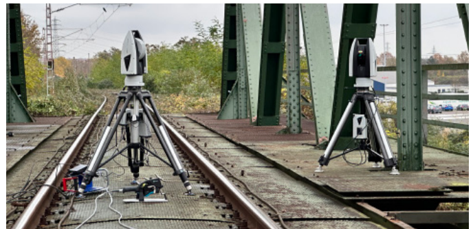
Capturing Intricate Geometry - Scanning the bridge’s thin steel structure required precise equipment capable of high-accuracy data capture.

The project also required working safely around different train schedules. “Along with everything else, we had to work around trains traveling across the bridge. The frequency varied — sometimes they’d pass through every 60 minutes and other times every 10 minutes. The train operator’s security team took care of us, which often meant we had to stop scanning and wait until they gave the okay that no trains would be passing and it was safe to start again,” Sommer said.