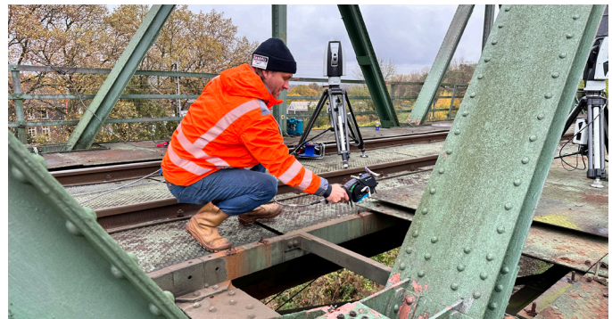
Scanning Hard-to-Reach Areas - The AS1-XL scanner enabled the team to capture detailed data from difficult-to-access parts of the bridge.